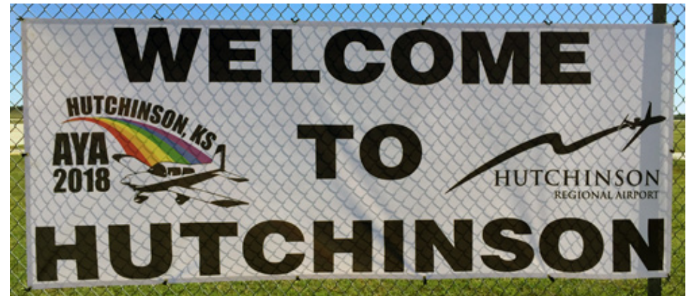
Airport Welcome sign