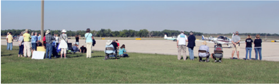
There was a pretty good crowd watching the Grumman Limbo.