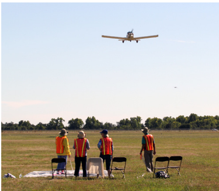
A few planes were lower than the required 200 feet...

You can see how far from the target I was standing-right, the bomb hit this close to me-see below.