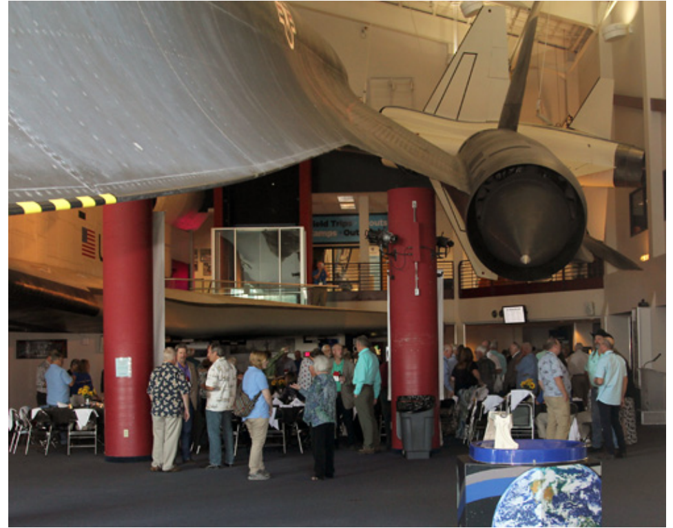
The windup banquet was held in the Cosmosphere below a SR-71 Blackbird, T-38 Talon and Space Shuttle mock-up.