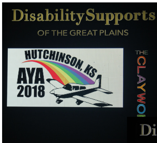
Electronic Welcome sign on N. Main Street in Hutchinson.