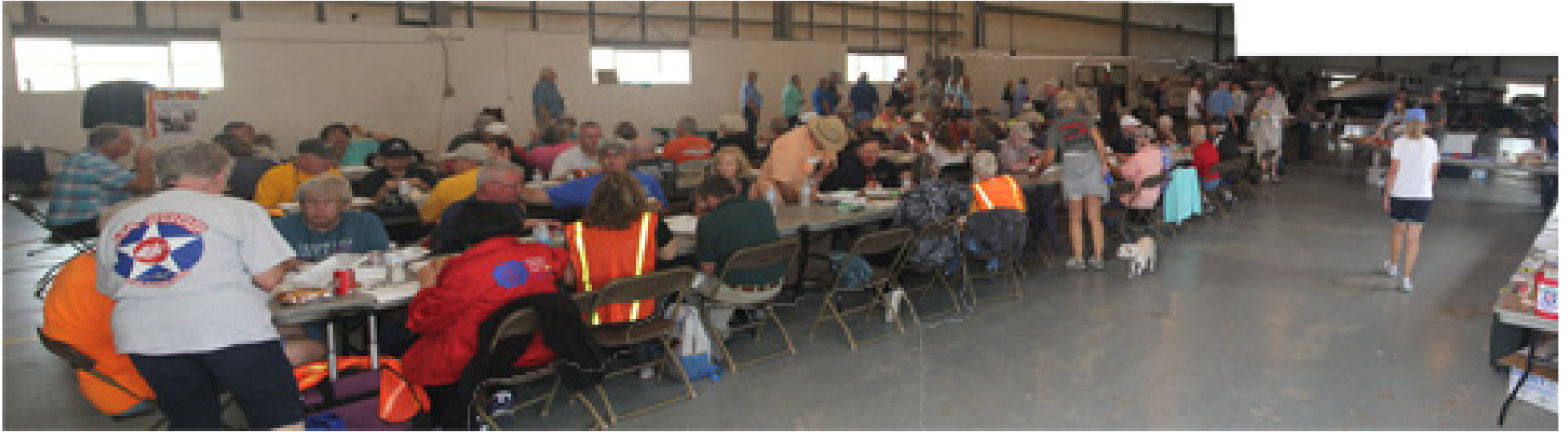
Lunch in the hangar.