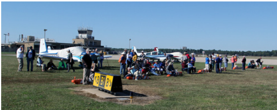
We had a pretty good group turn out to watch the Flour Bombing event. Even a few locals came out.

You can see how far from the target I was standing-right, the bomb hit this close to me-see below.