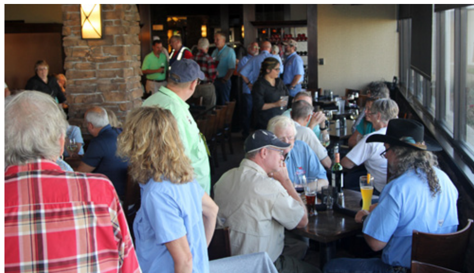
A small portion of the group.