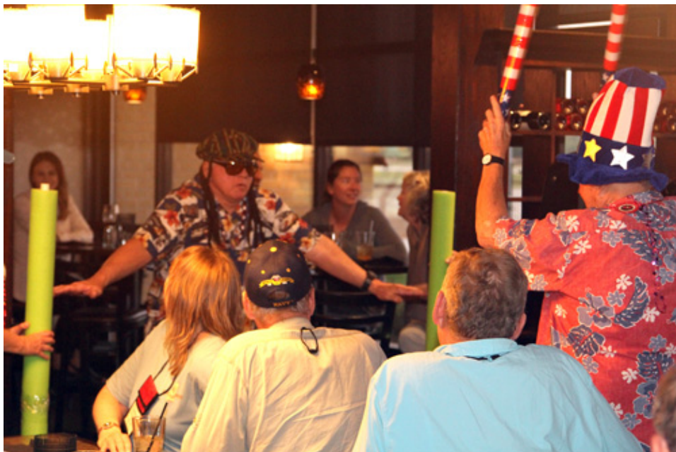
The Rasta crew showed up to demonstrate the Grumman Limbo event.