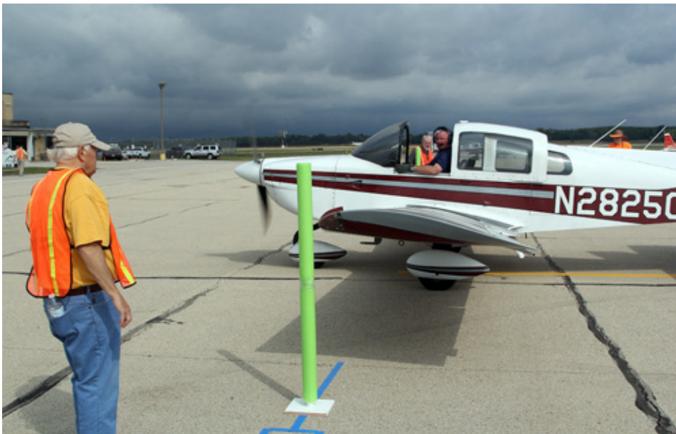
After the first three rounds of the Grumman Limbo no one had been eliminated. Due to the front you can see in the background the Grumman Limbo was postponed. The winds were gusting to 27 knots by the time the planes finished tying down.