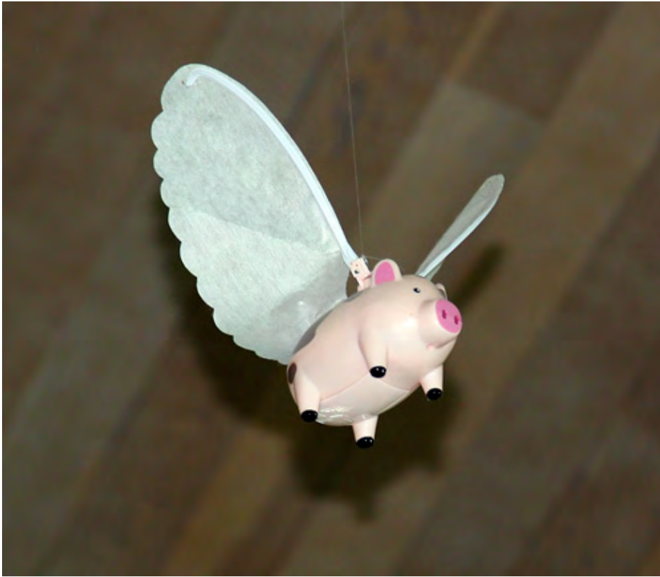
Anything is possible in California.