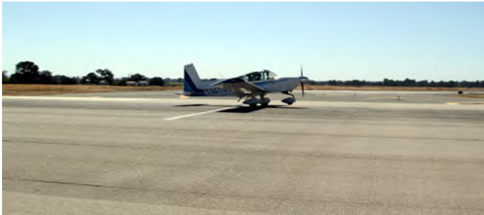
This looks like a pretty good shot at winning...to the right not so much.