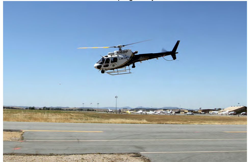
The CHP is keeping an eye on us...