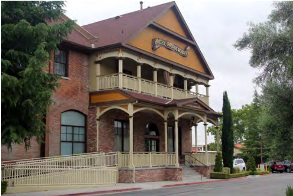
The wind up banquet was held at the historic Paso Robles Inn.