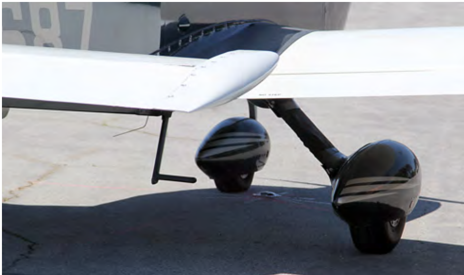
Close but no glass of wine, better job to the right.