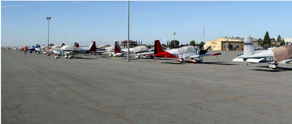
Monday morning flight line, 18 planes on the airport and more coming.