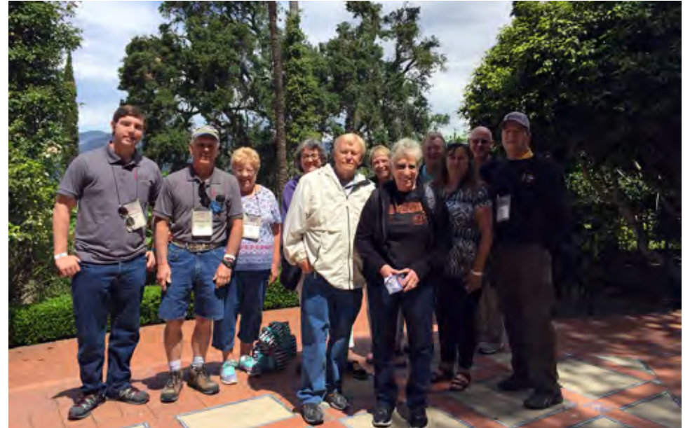
Quite a few members went on the guided Hearst Castle tour Wednesday morning.