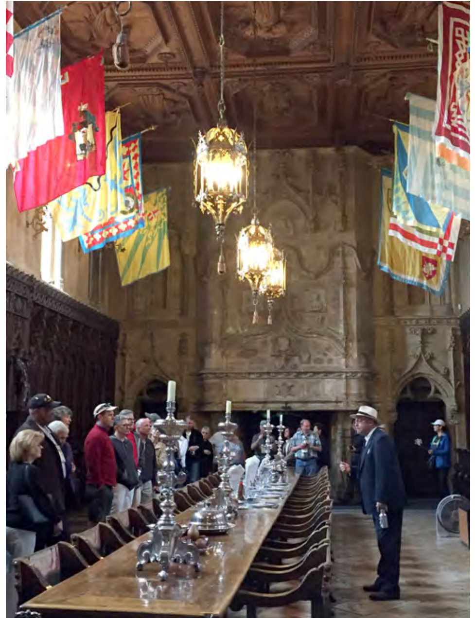
To the left, the view became spectacular once the fog lifted. Above, the dining(?) room with an assortment of various horse racing flags.