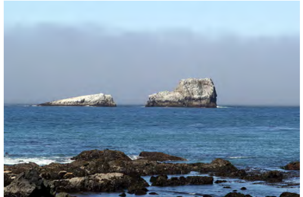
Early morning on the Pacific coast.