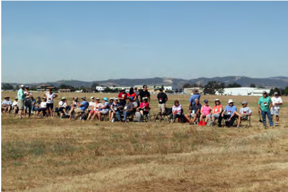
The spectators for the flying events had premium seating this year. You could almost taste the flour in the air...