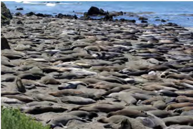
Elephant Seal rookery on the coast just north of San Simeon on Highway 1 west of Paso Robles. The bus tour to Hearst Castle went by this area.