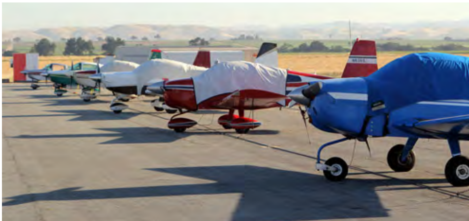
Tuesday morning saw about 39 planes on the ground.