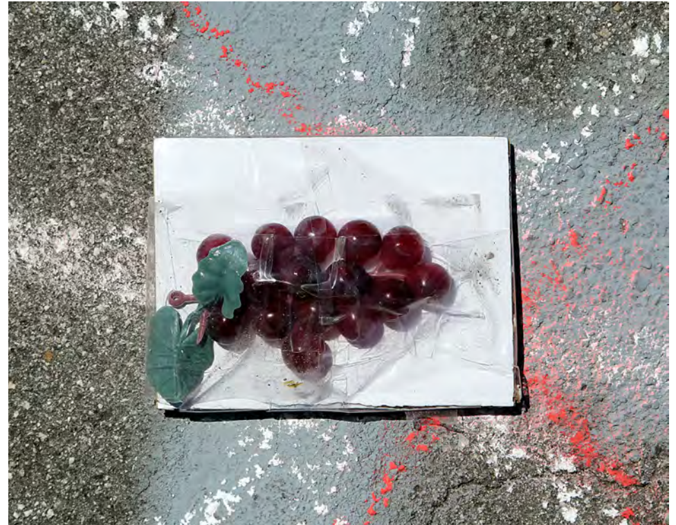
In keeping with our past themes which reflect the local area this year the Precision Taxi targets were bunches of grapes. We thought we could squeeze a few grapes and have fun in the process. Unfortunately not many grapes got squeezed...