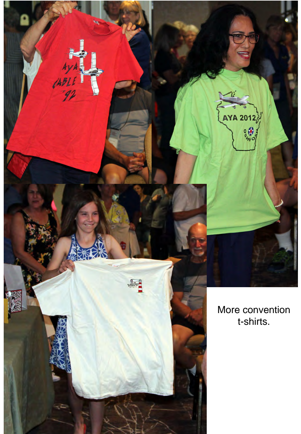
More convention t-shirts.