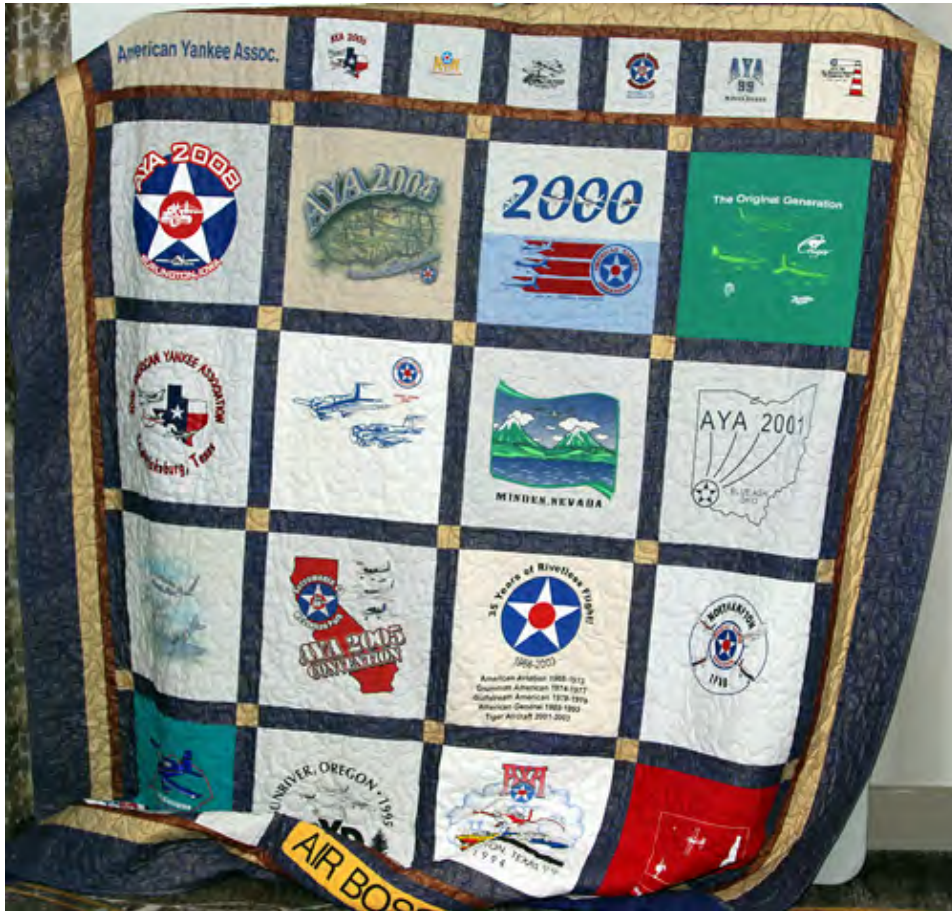
A prized possession, a quilt made from convention t-shirts, from a previous convention was donated back to the Scholarship Auction to raise funds. An additional $275 was raised for the AYA Scholarship Fund. Thanks to everyone who donated and purchased auction items.