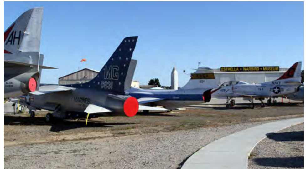
The Welcome Reception and Firsttimers Welcome were held at the Estrella Warbird Museum.