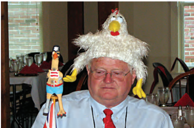
Self explanatory really...