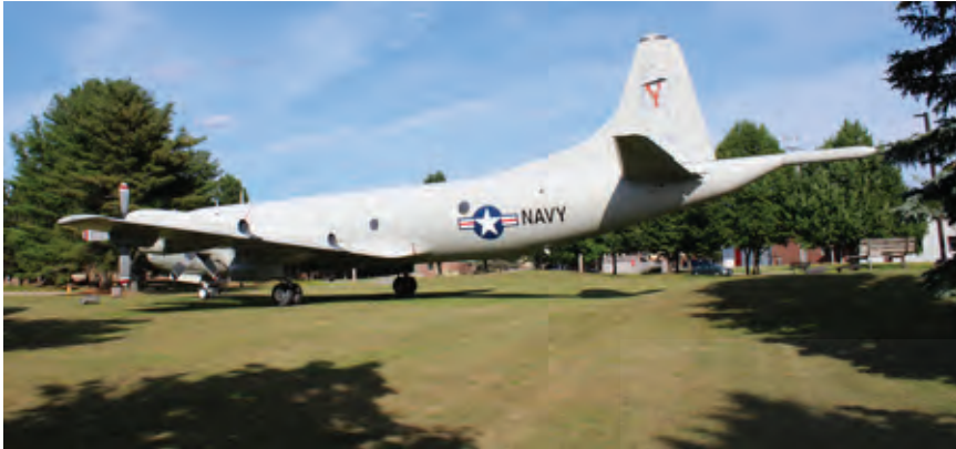
The P3 Orion is one of the planes still on display at the former NAS Brunswick.