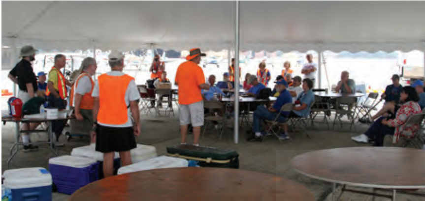
Wednesday morning briefing.