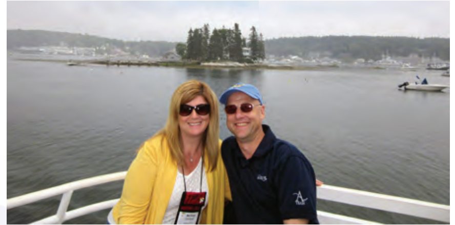
Nothing like a romantic sea voyage to generate an appetite...