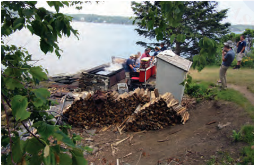
The busy cooks prepared an awesome meal. There was no shortage of food.