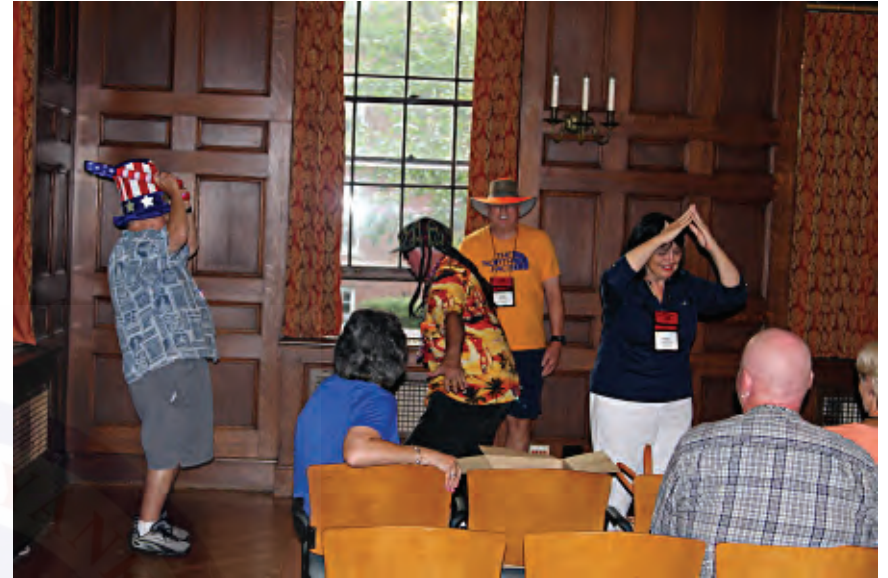
The Rasta team was back with a demo of the Grumman Limbo.

Following the First Timers Orientation everyone enjoyed some finger food and re-hydrated at the Welcome Reception.