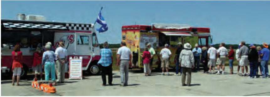
The food and ice cream trucks proved popular this year.