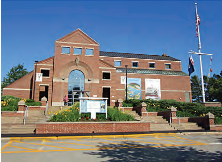
The final night banquet was held at the Maine Maritime Museum. AYA 2015 attendees were offered free admission over two days to go through the museum.