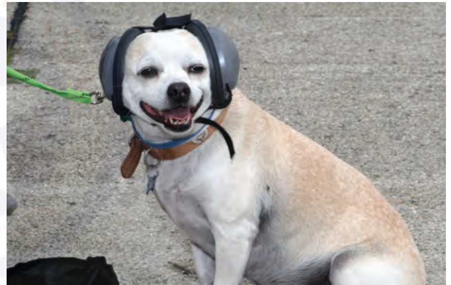
Emmy seemed to enjoy the ground competitions.