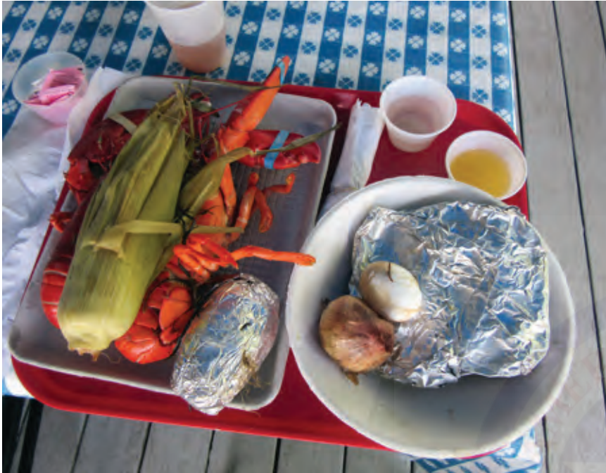
There were a dozen clams in the foil also.