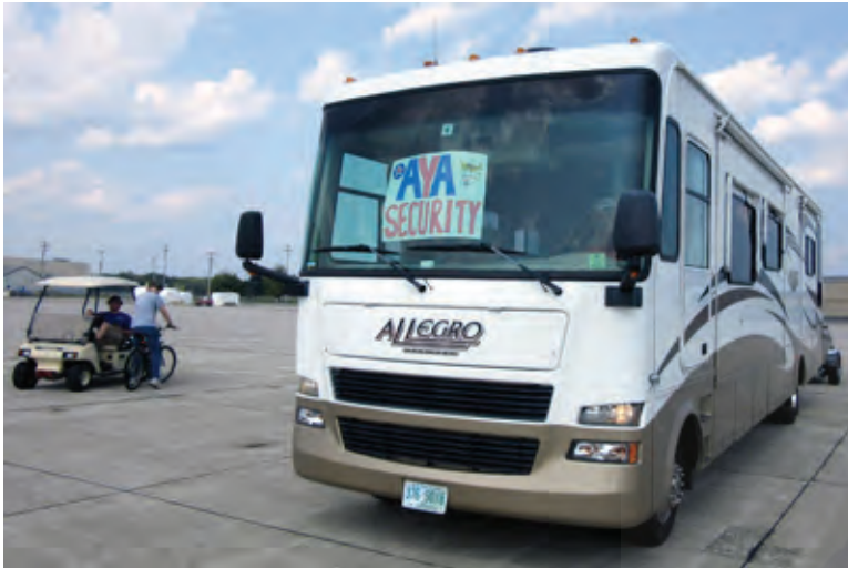
The sign is self explanatory. I think someone wanted to be close to the flight line for Dawn Patrol...