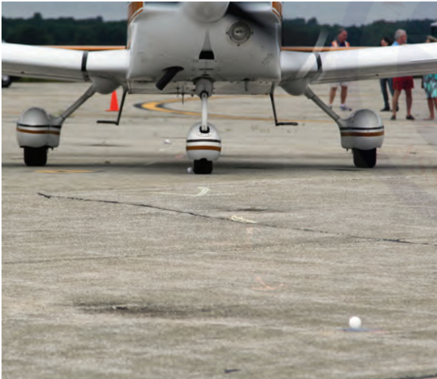
It looks easy enough...