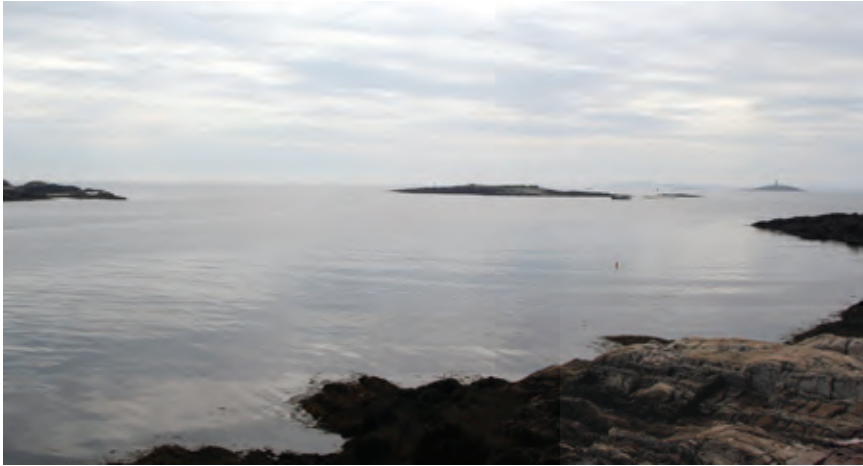
A few members visited Lands End, south of Brunswick. The statute is a tribute to Maine fisherman.