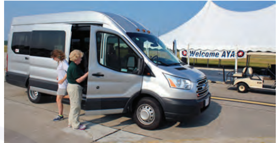
Now that's a van.