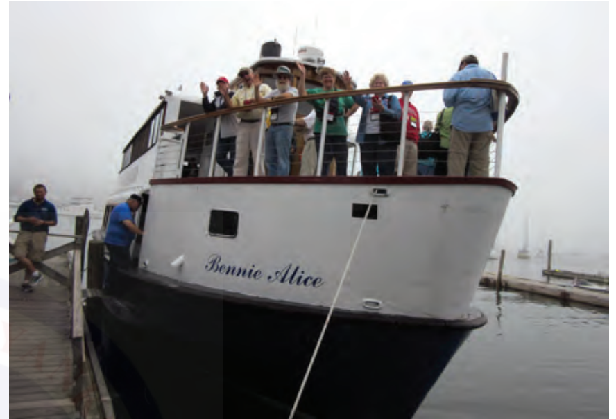
Tuesday was Clambake Day. Members travelled to Cabbage Island aboard the Bennie Alice. There was some nice scenery and wildlife on the sail.