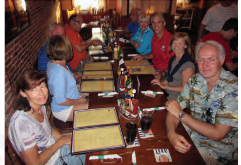
Let the visiting begin.