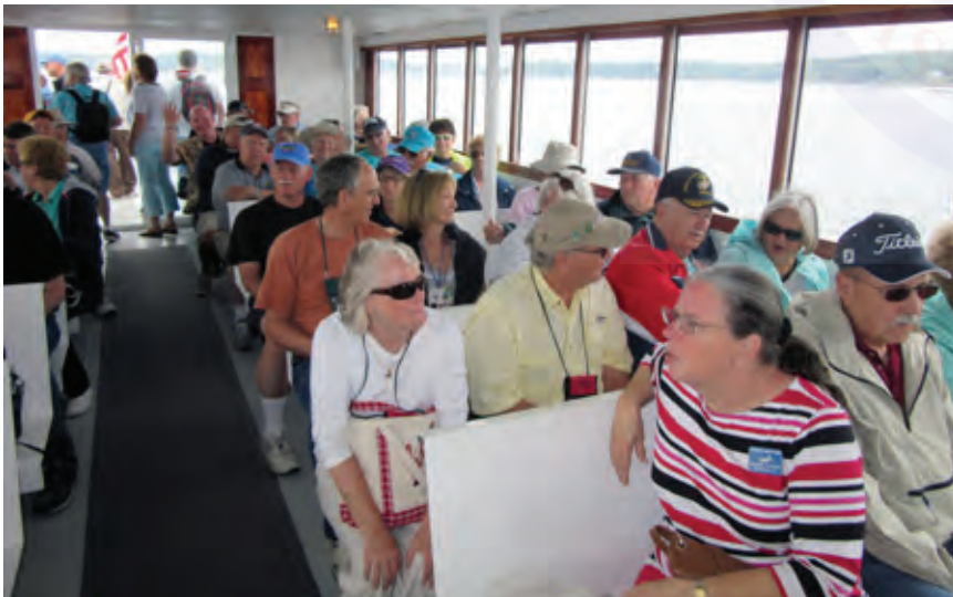
Everyone seemed to enjoy their Clambake Cruise.