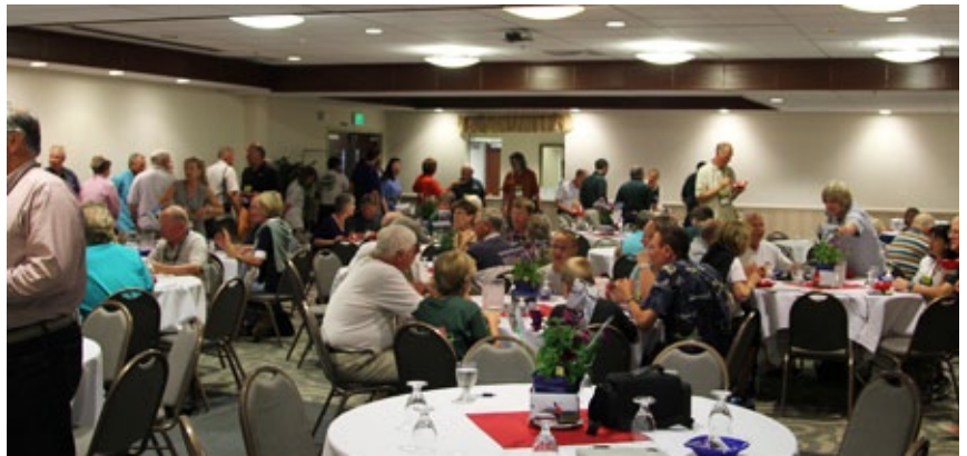
The AYA Scholarship raised $610 at the Ice Cream Social.