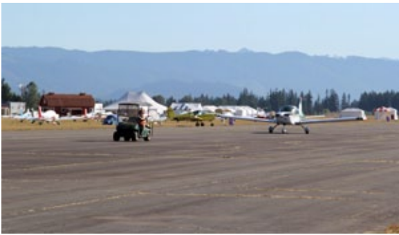
Taxing out for the Flour Bombing and Spot Landing events.