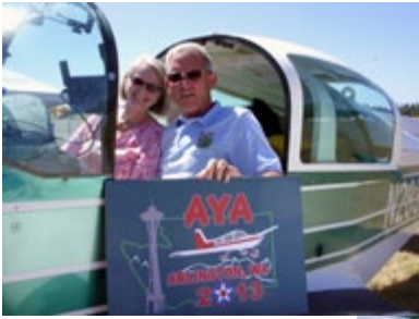
A few of the early arrivals