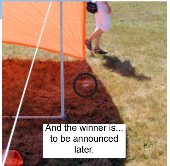
And the winner is... to be announced later.