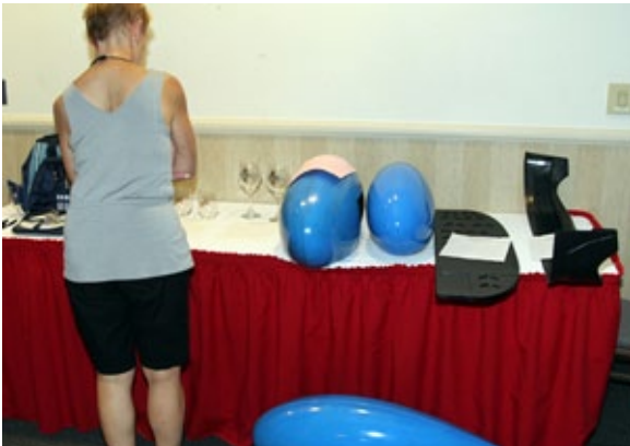
Donated AYA Scholarship Auction items.