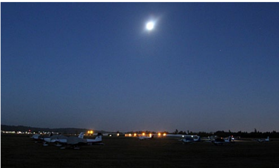
Friday night was cool and clear, unlike Saturday morning with the lingering fog.