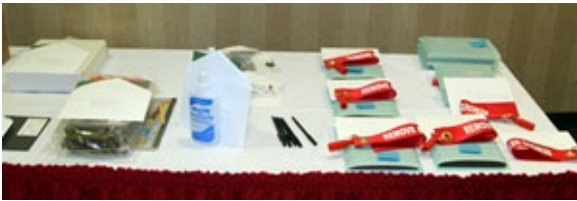
Tuesday Door Prizes