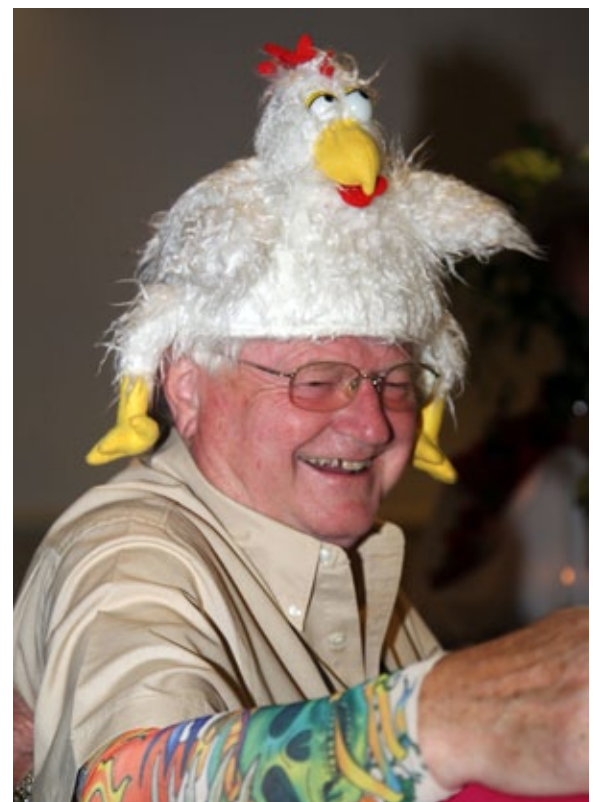
Mr. Captain Chicken Man is back sporting a new hat. Judging by the expression on the chicken he is not thrilled about being stuck on Mr. Captain Chicken Man's head.