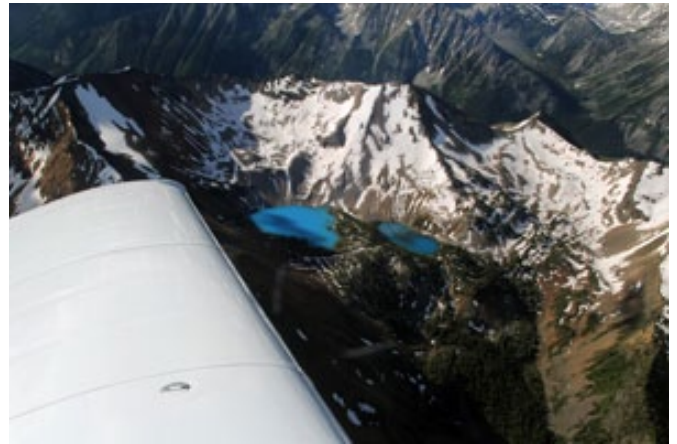
A couple of photos from my trip to convention taken at about 10,500.