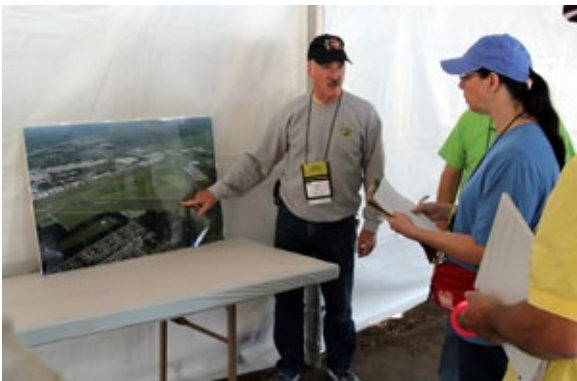
Tuesday briefing for the ground events.