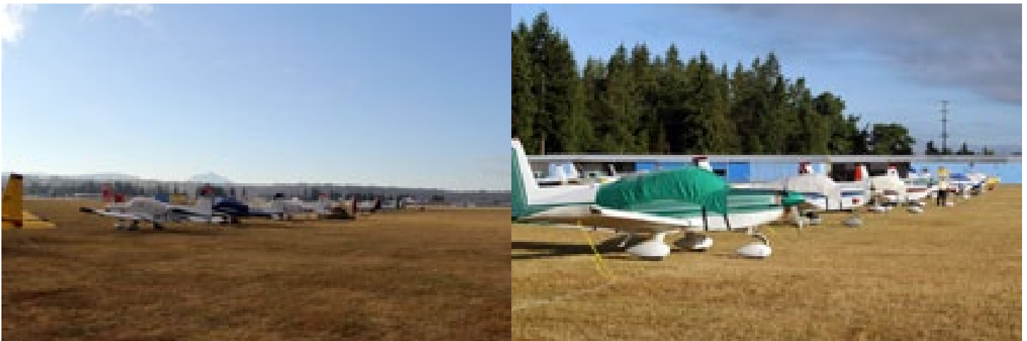
Monday morning dawned mostly clear and cool with about 27 Grumman aircraft on the ground. Some members have been in since Thursday to attend the NW Fly-in or tour the Seattle area.