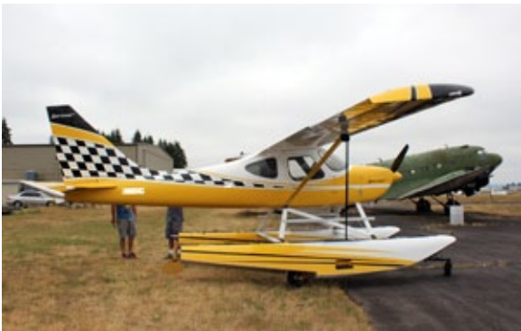
Conventioners enjoyed a tour of the Glasair Aviation factory on the Arlington airport.