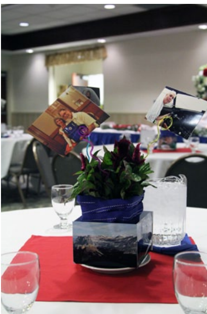
The center pieces this year featured welcome photos of this year's attendees as well as a mix of photos from past Conventions.