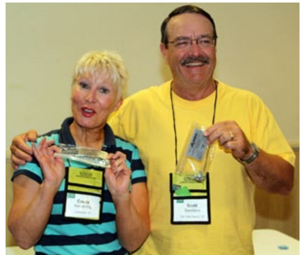
The always lurking battery wing nuts door prize.