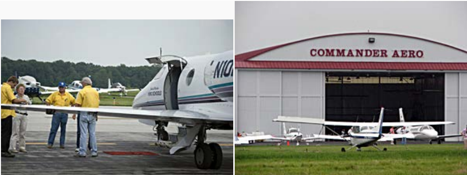
The King's of King Schools were in the neighborhood. Commander Aero was our host FBO.