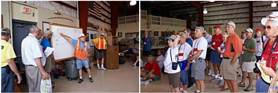
Every event involving aircraft movement has a briefing. The AYA is proud of it's safety record and is always looking to make improvements. The Board passed a new Visitor Safety program this year. We invariably receive strong support from the airports and officials we deal with at conventions for the professionalism and good attitude of our volunteers and members.