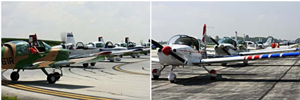
Air Race participants staging for the big race, the winners are...