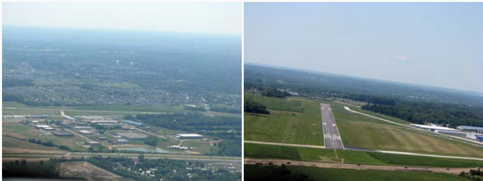
Dayton Wright Brothers Airport, looking east. Final on Runway 20, Dayton. We had about 40 planes on the ground Sunday evening.