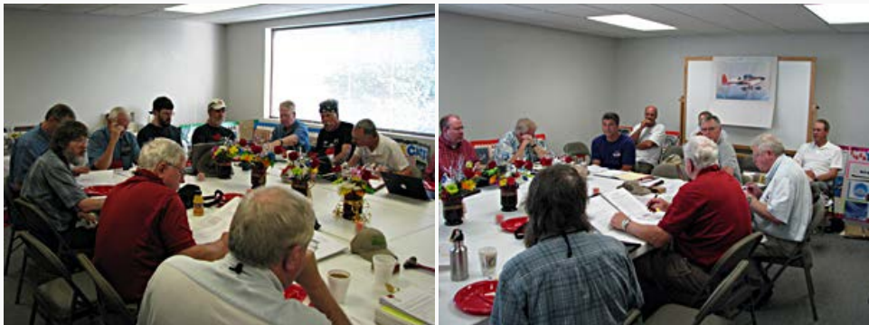
Your Board at work making the hard decisions that help to keep the AYA moving ahead.