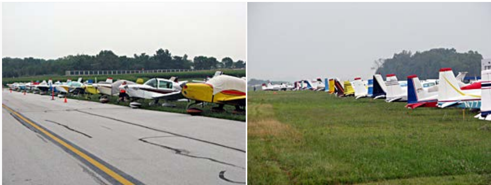
Tuesday dawned, well, it was pretty cloudy with low ceilings. Flour Bomb and Spot Landing competition was started. Turned out to be a three day event.