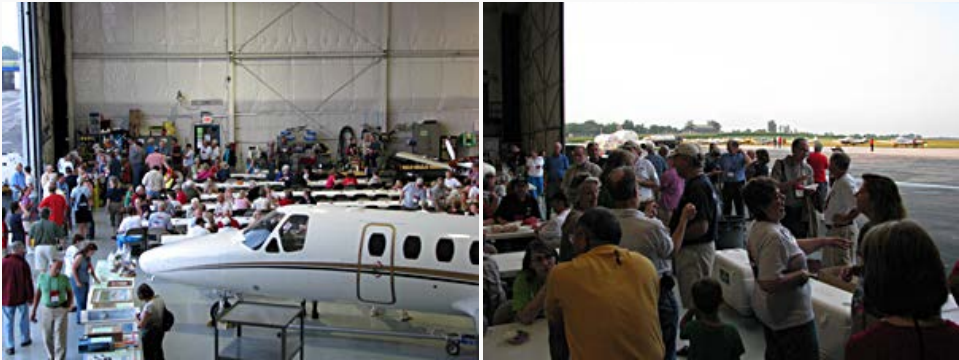
Tuesday evening was the Ice Cream Social and business meeting at the Commander hangar.