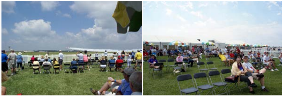
AYA Chalet at the Dayton Airshow