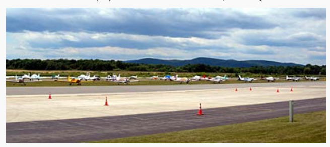
Part of Sunday's flightline