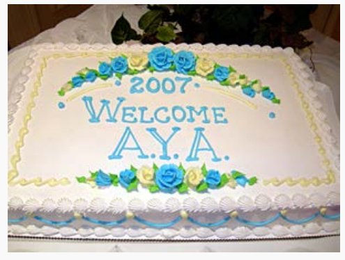
Cake at the Welcome Reception

Many thanks to the generous individuals and companies that make the door prizes possible. Links will be provided on the website after the convention. Well over 60 planes are on the ground now.