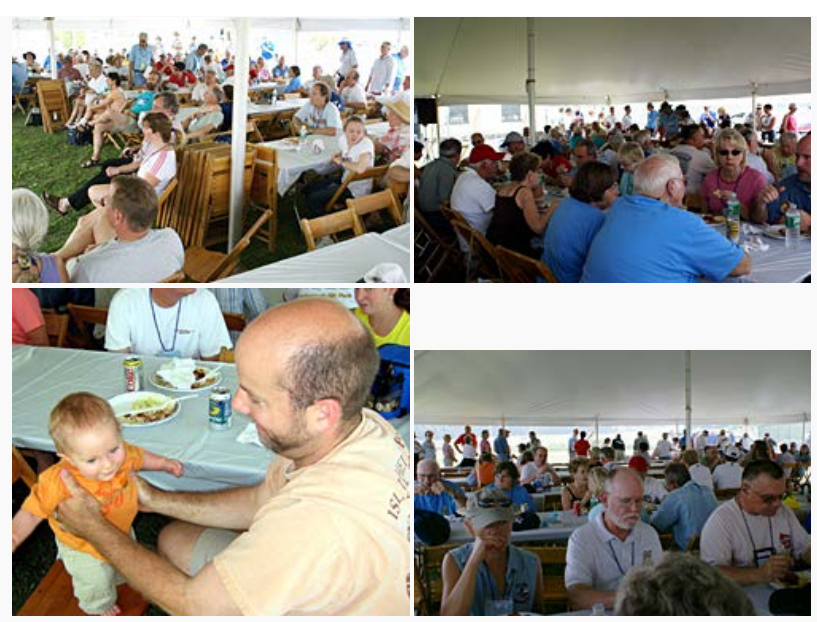
The airport barbecue lunch