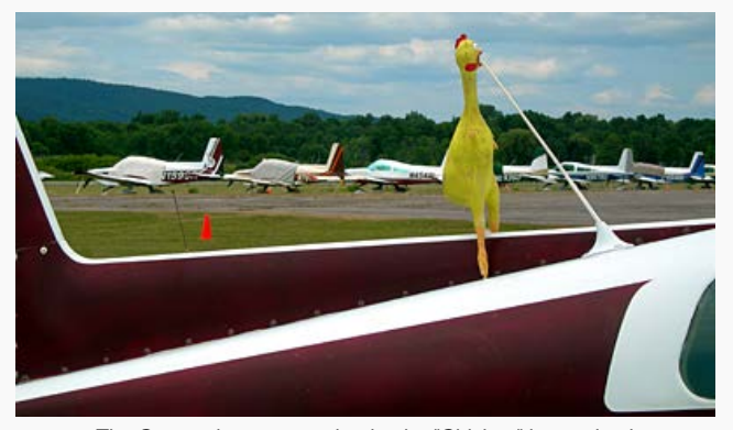
The Convention can now begin, the "Chicken" has arrived

About 25 additional planes arrived today, much visiting and re-acquainting at the airport. It is nice to see old friends again. The internet connectivity at the hotel is less than acceptable, hopefully the situation will improve. I will try and keep this area going.