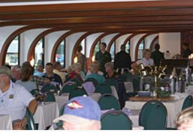
Eating and Cruising