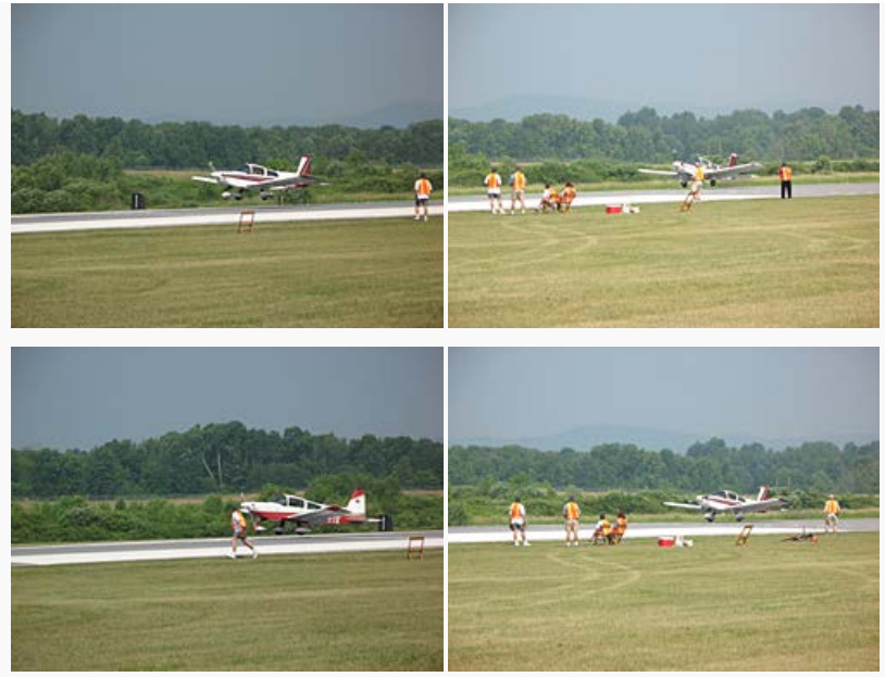
Some of the 30+ Spot Landing contestants