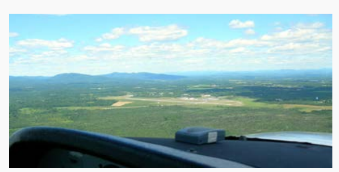
The Glens Falls airport