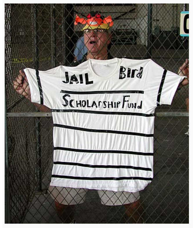
Sheriff Guy finally comes to justice