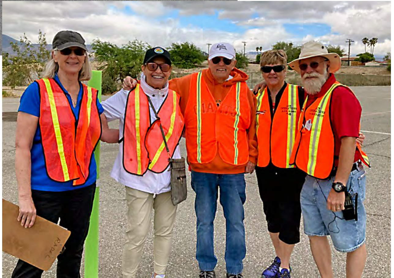
The Grumman Limbo Team.