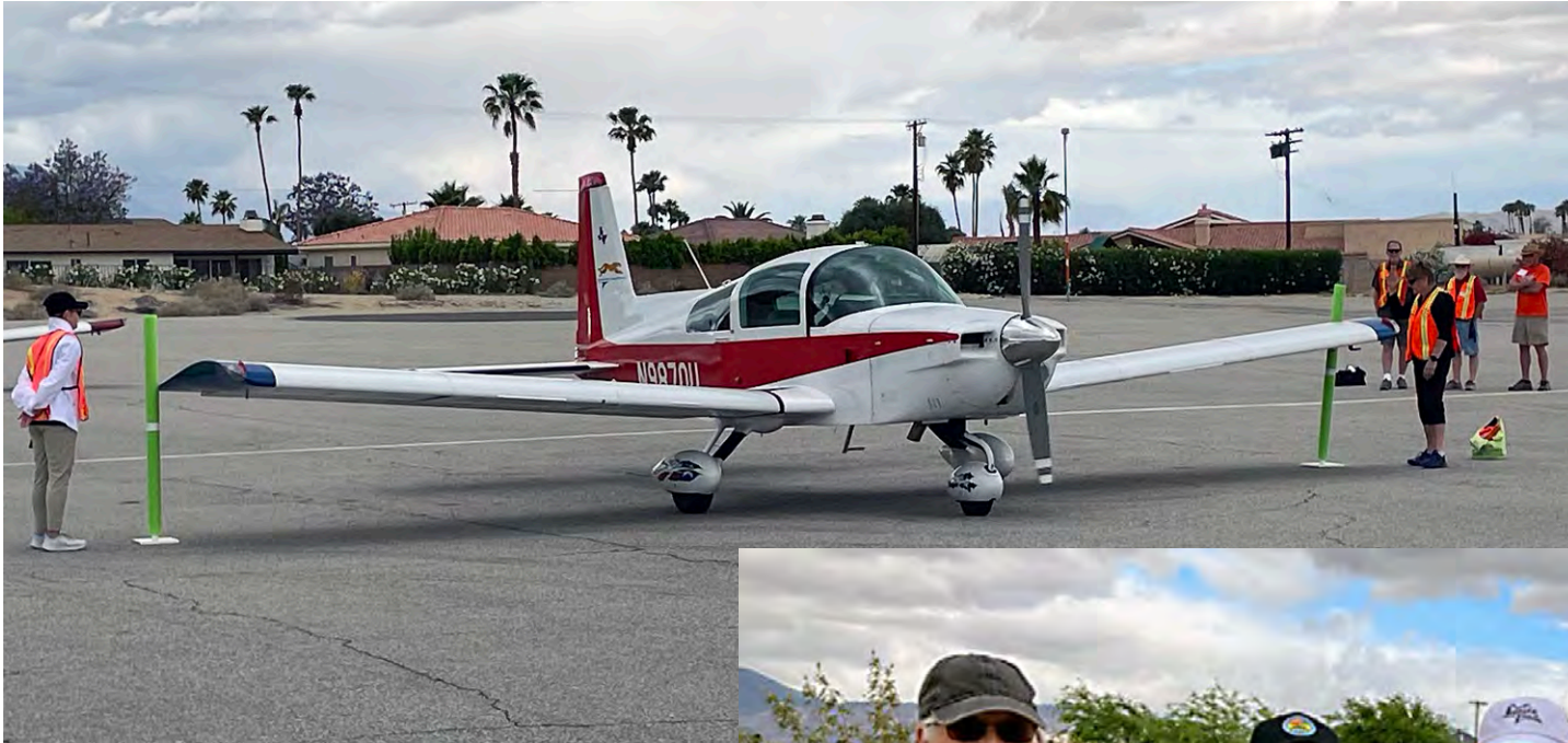
Grumman Limbo, 4 Place Winner.