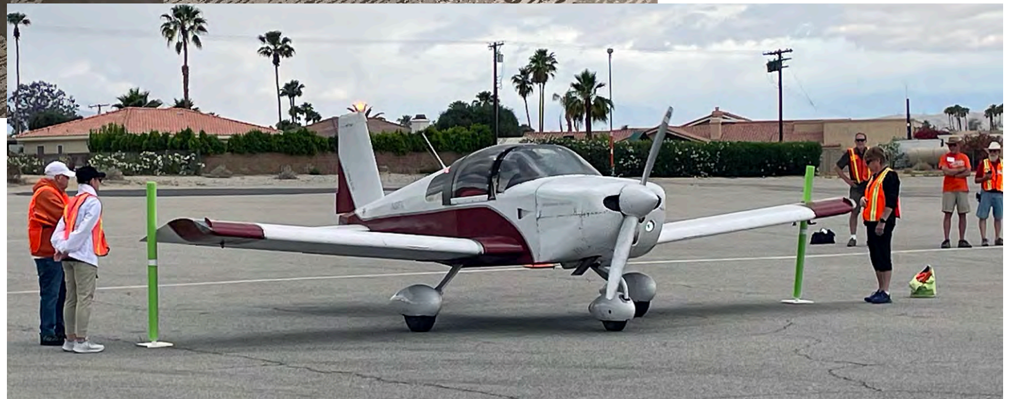
Grumman Limbo, 2 Place Winner.