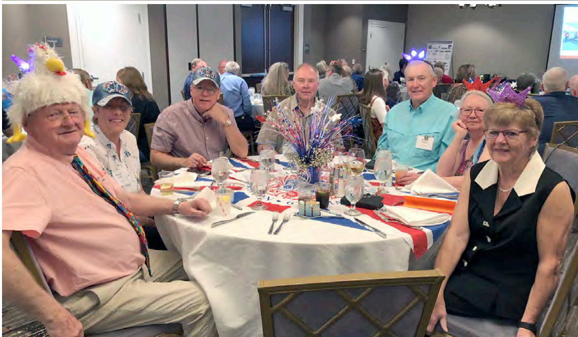
Lower, left, the Commonwealth table at the windup banquet, below is a table centerpiece.