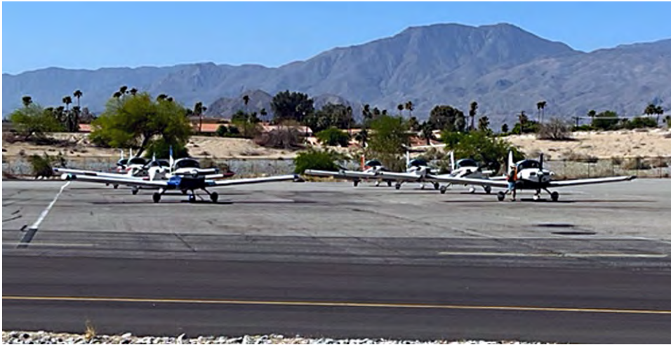
Ready for the flying games.