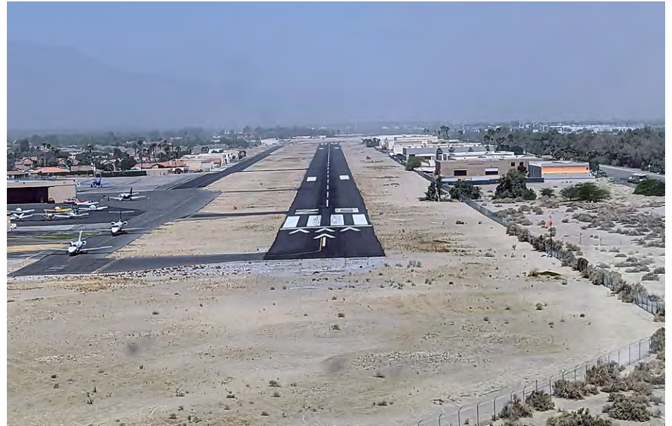
Final, Runway 28.