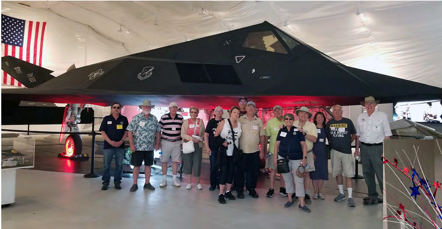
Palm Springs Air Museum tourists.