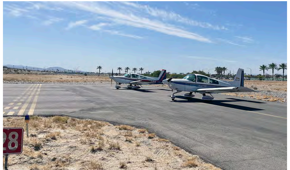
Final checks before the flour bombing and spot landing.