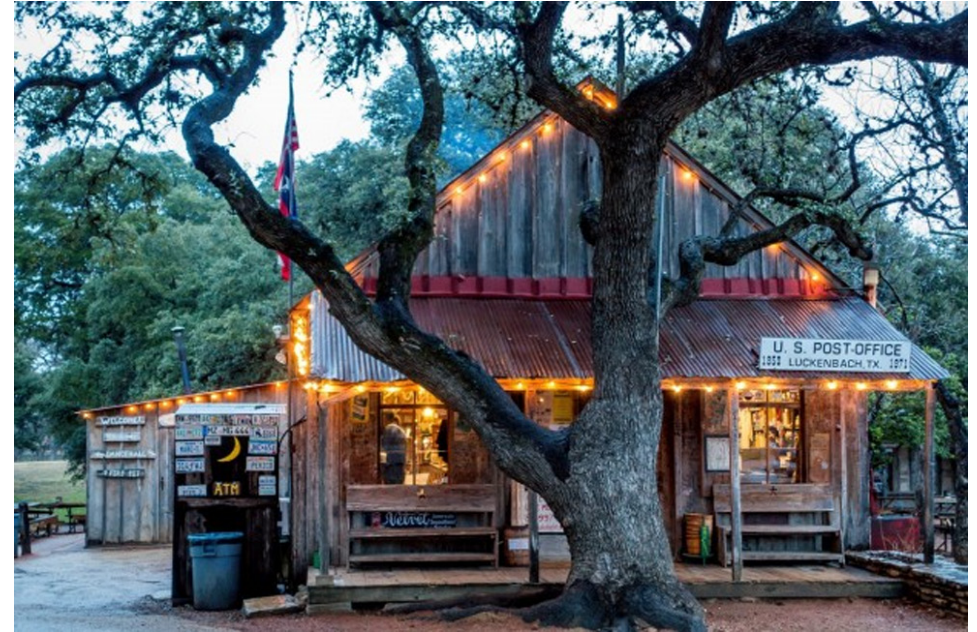
Lukenbach Post Office

Just a few miles northeast of town is Enchanted Rock State Park which features a huge granite dome rising 425 feet above ground. It's one of the largest batholiths in the U.S. and according to the park service, is one of the best examples of an exfoliation dome anywhere in the world! Wow! Now that alone should be reason enough to polish your spinner and head on down here to see. Even if you don't take the time to drive out to the park, you really should plan to fly over it on the way home as it truly is an impressive sight.