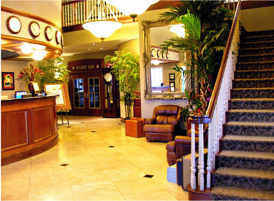
Hangar Hotel above, and downtown shops in Fredericksburg below.