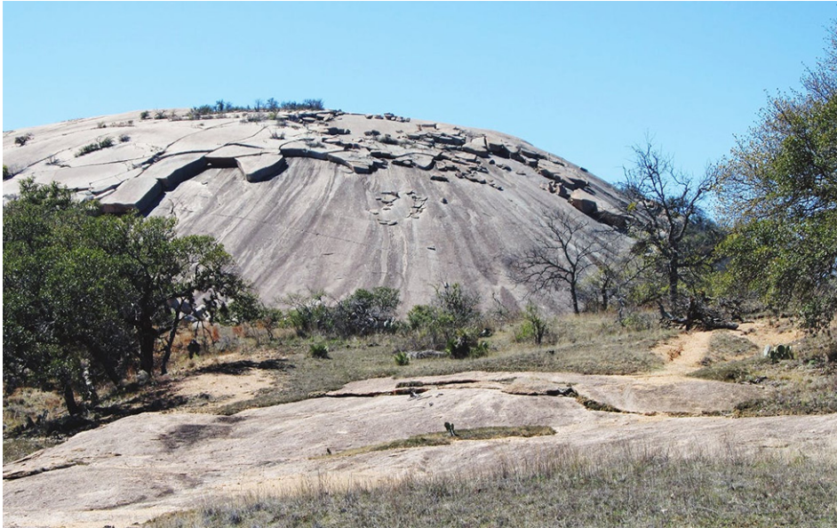
Enchanted Rock State Park, which features a huge granite dome rising 425 feet above ground.

The city is also home to the Admiral Nimitz Historic Site and the National Museum of the Pacific War. This museum is one of the very best in the country and is located in the heart of the city, an easy stroll from the overflow hotel surrounded by many shops and restaurants. Just down the road a short drive from town is the world famous outpost of Luckenbach, made famous by Willie, Waylon and the boys. Even though there are only about 10 permanent residents, the dance hall, general store and saloon can pack in thousands of country music lovers on a busy weekend. Known for it's friendly atmosphere and laid back vibe, the little settlement has hosted numerous music festivals, chili cook-offs, a 'Hug-In' and even its own 'World's Fair'. Their slogan: "Everybody's Somebody in Luckenbach" pretty much says it all.